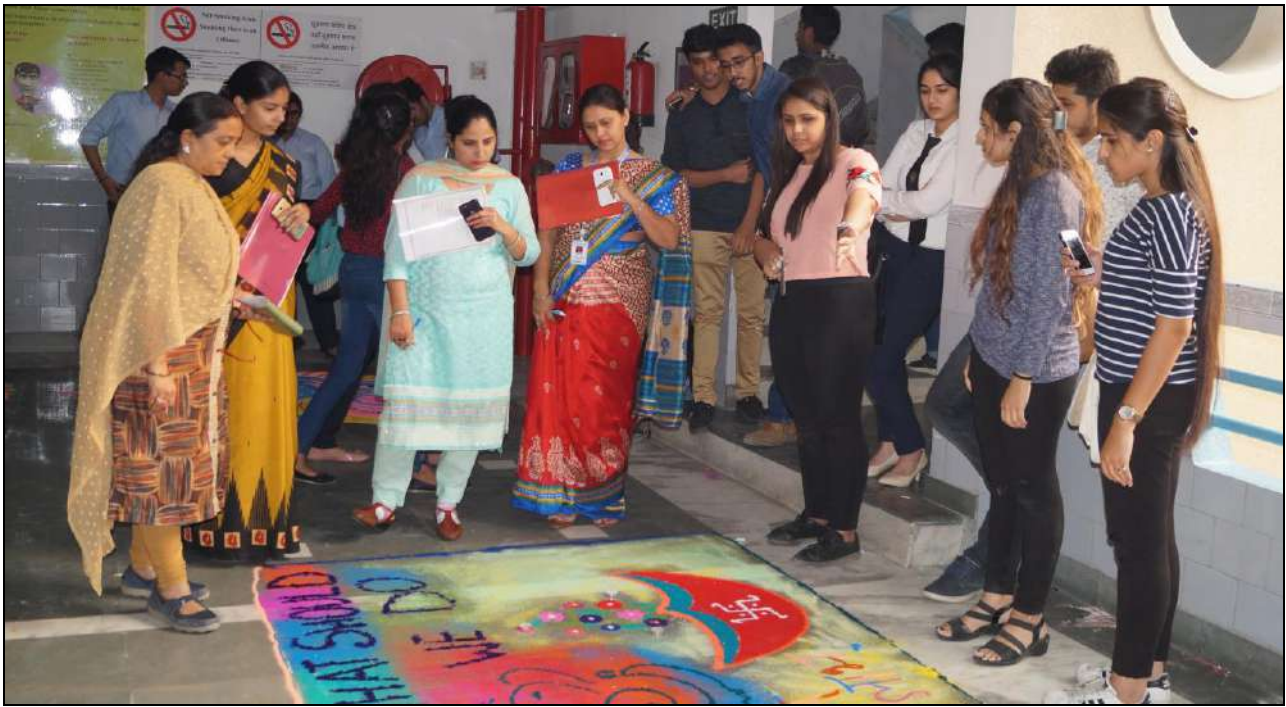
Judges evaluating the colourful depictions!!!