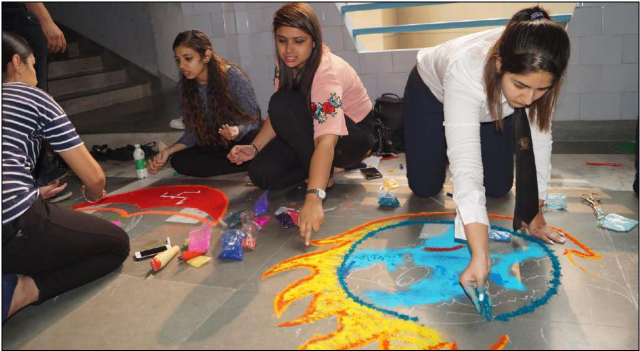
Students displaying their skills of making rangoli!!!