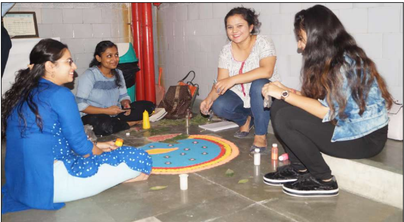
Students showing their creativity with use of colors!!!