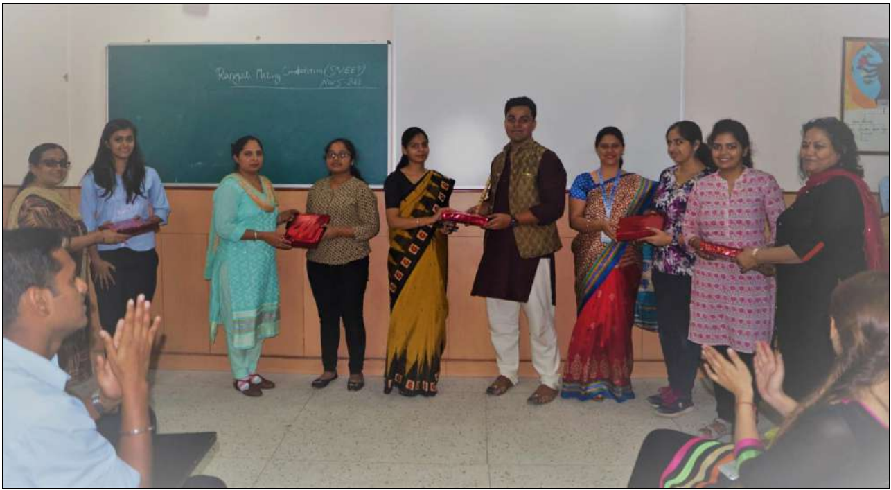
1st Runner Up Team!!!