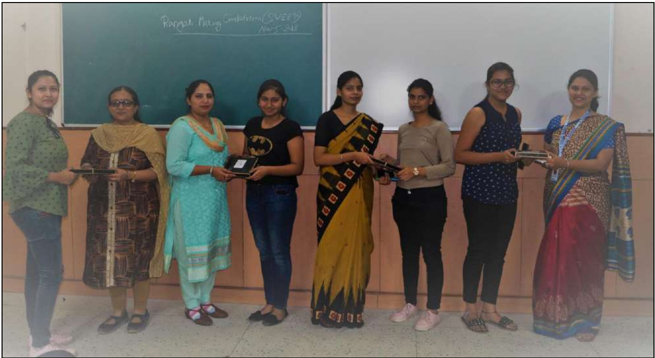
Winning Team !!!