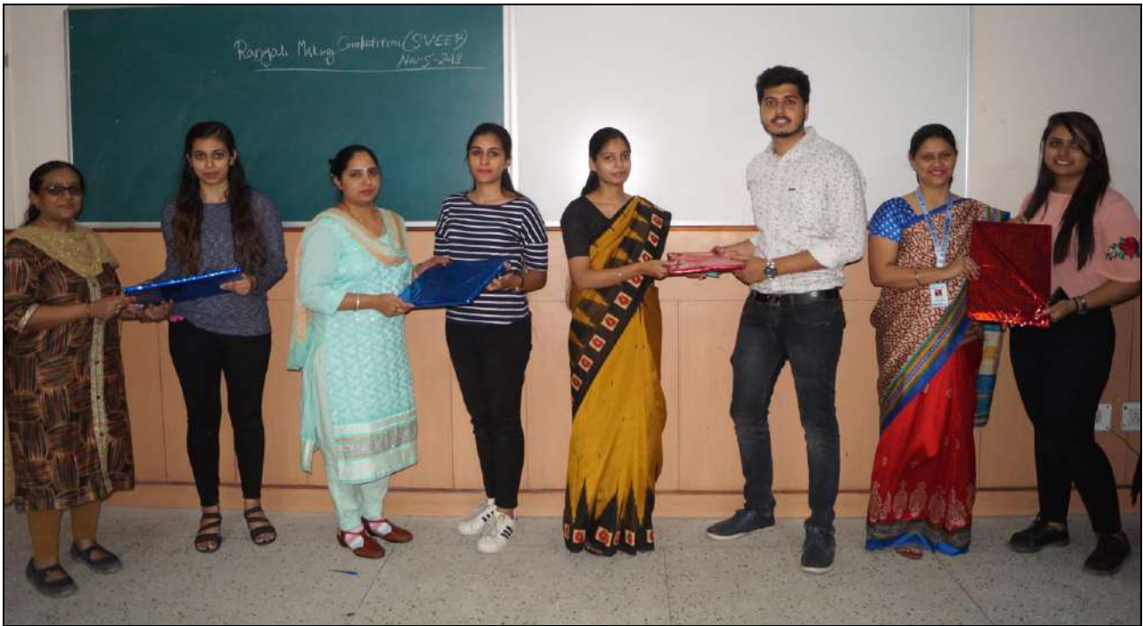
2nd Runner Up Team!!!