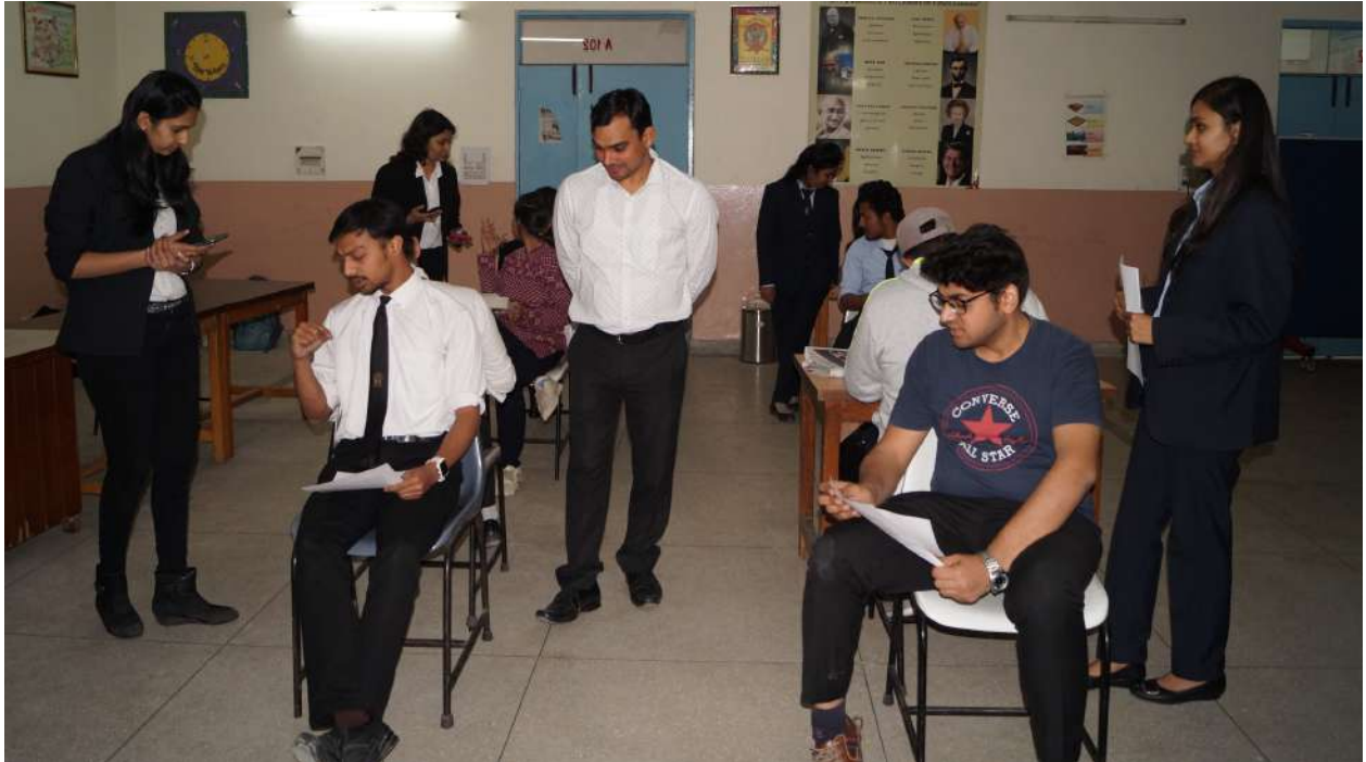
Round 2: Blind Drawing Game- "It takes a great man to be a good listener."