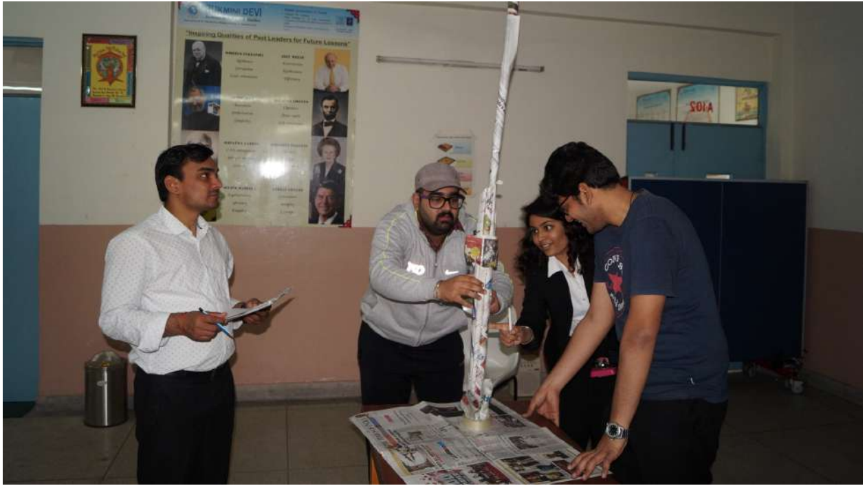
Round 1: Participants building the newspaper tower