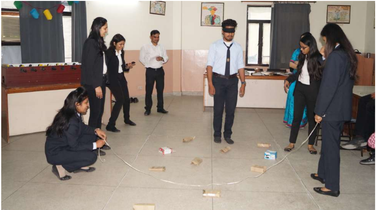
Round 3: Trust Course Game-“Trust is the lubrication that makes it possible for teams to work.”