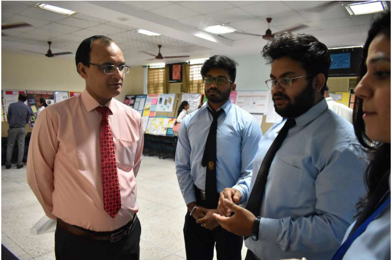
The Zealous researchers with their Mindboggling creations.