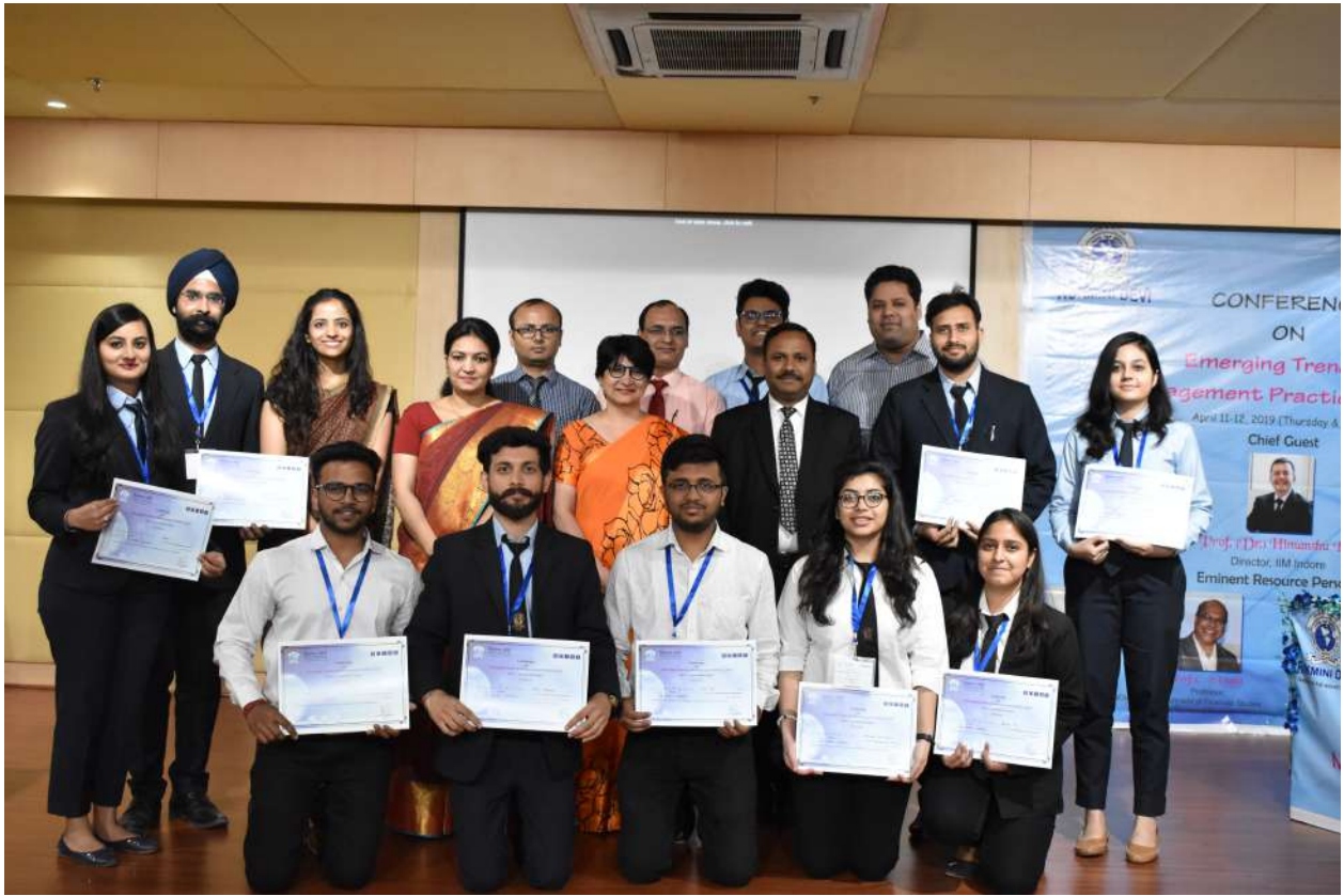
Proud Moment: All together -R&D Board and Student Coordinators