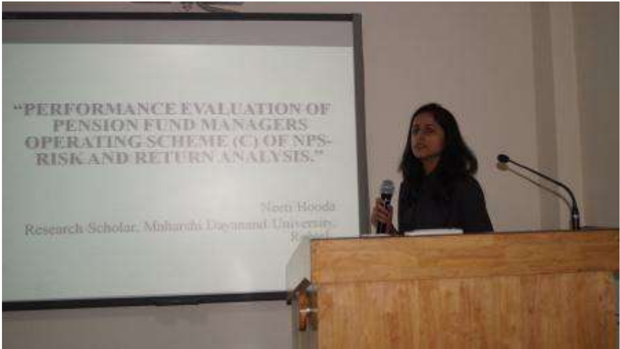
Paper presenter presenting his research work