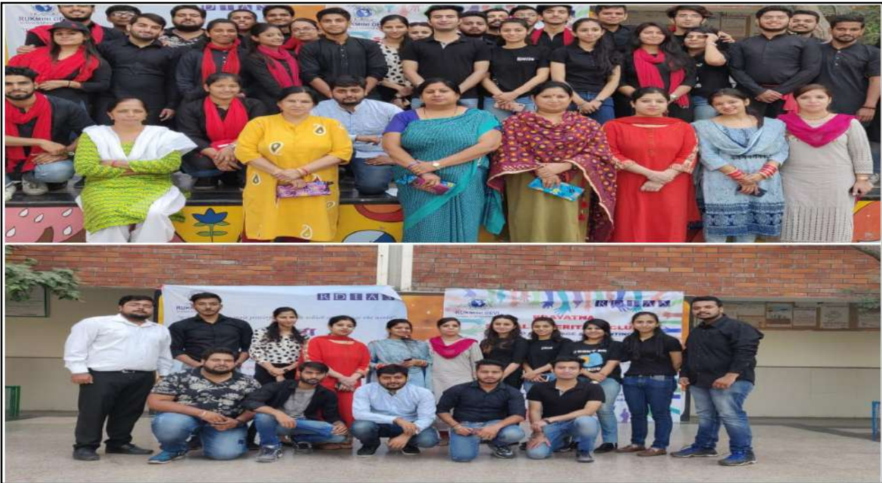
Collaborative Team effort putting in their best.