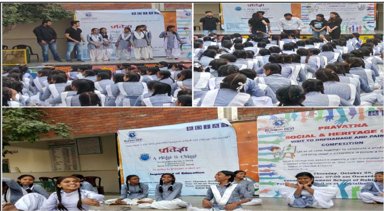
Farewell to filth, hello to health: Glimpse of health and hygiene drive in Government School.