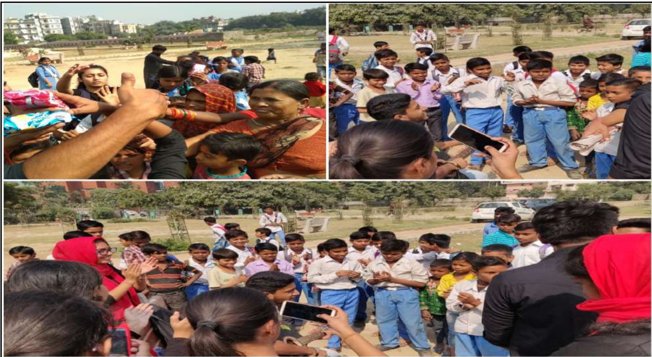
Visit to a slum and donating items raised.