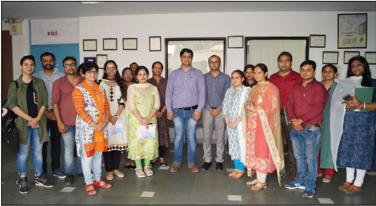
Participants with their certificate!!!