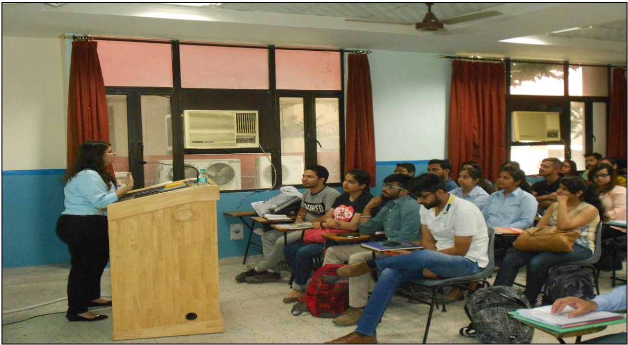
Session in Succession.