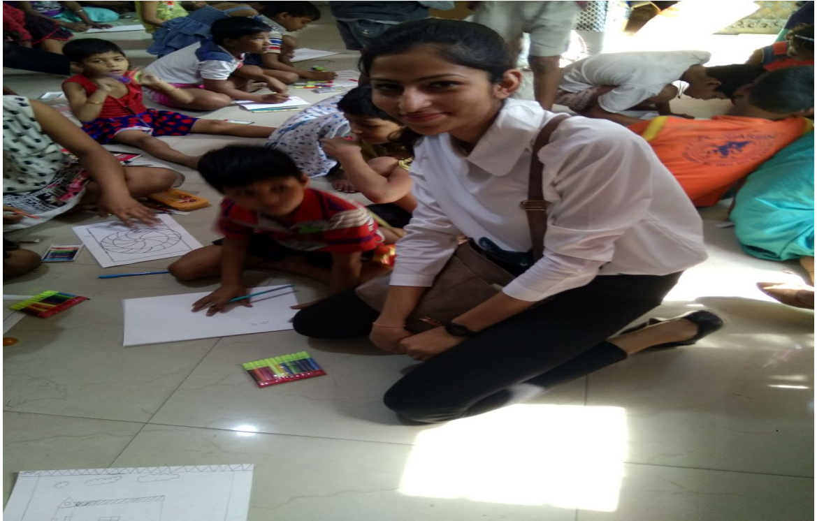
Preparing Tiny Tots for the drawing competition...!!