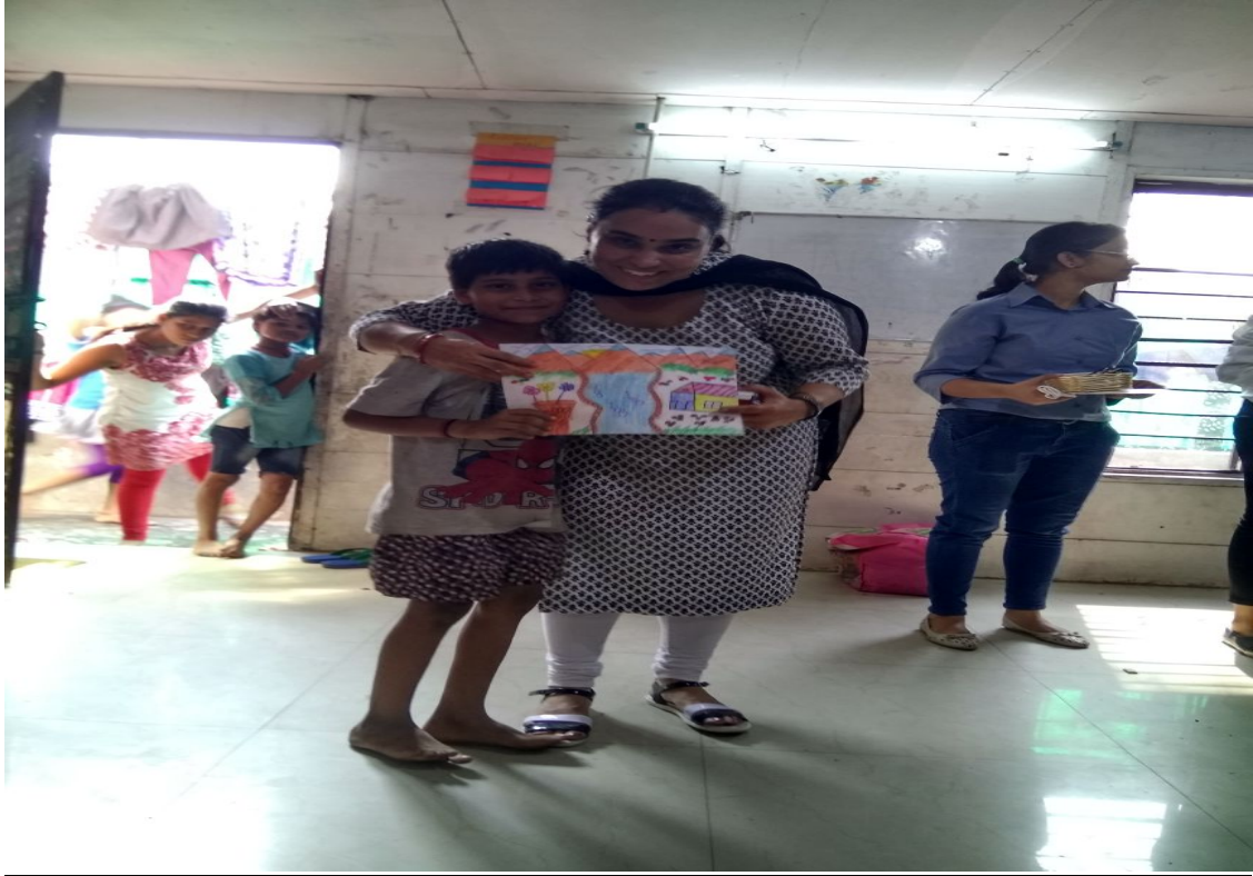
Faculty member with the winner of the drawing competition..!!