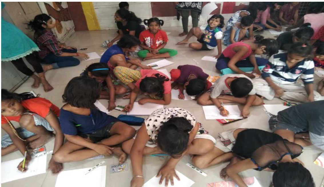
Buzzing Spirit in the kids..!!