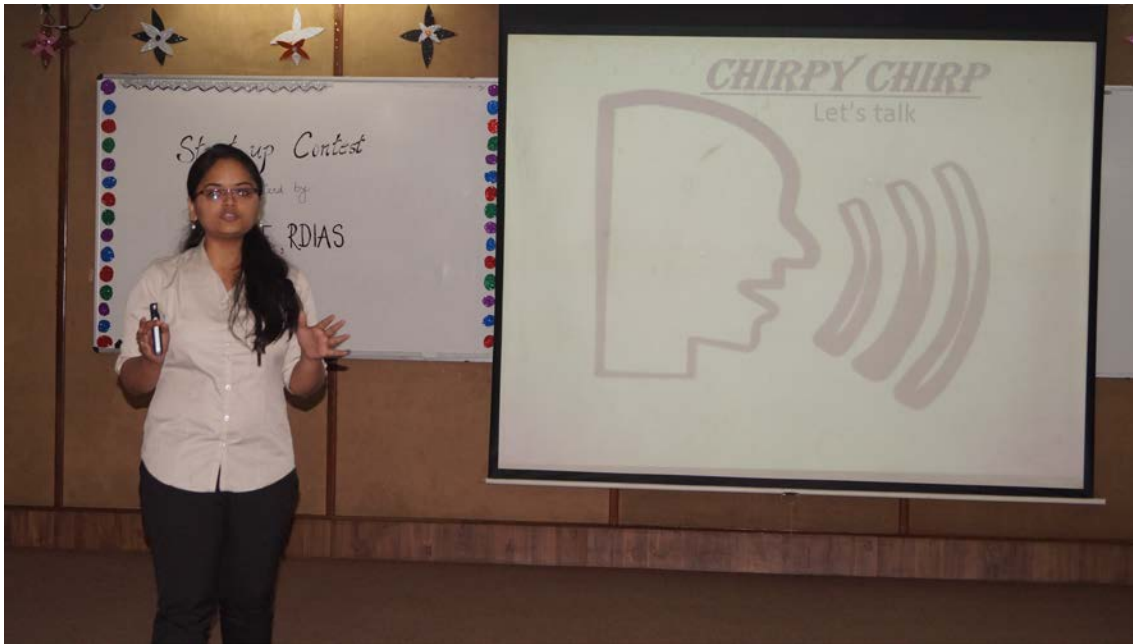
Participant is presenting her start up idea..!!