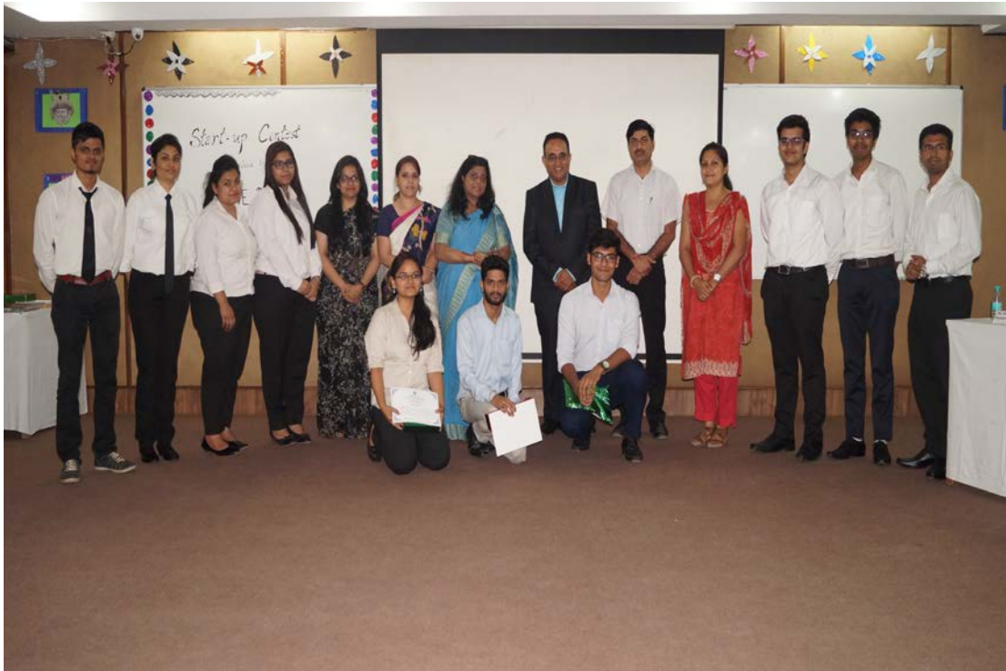
Finally the winners and student coordinators of the contest..!!