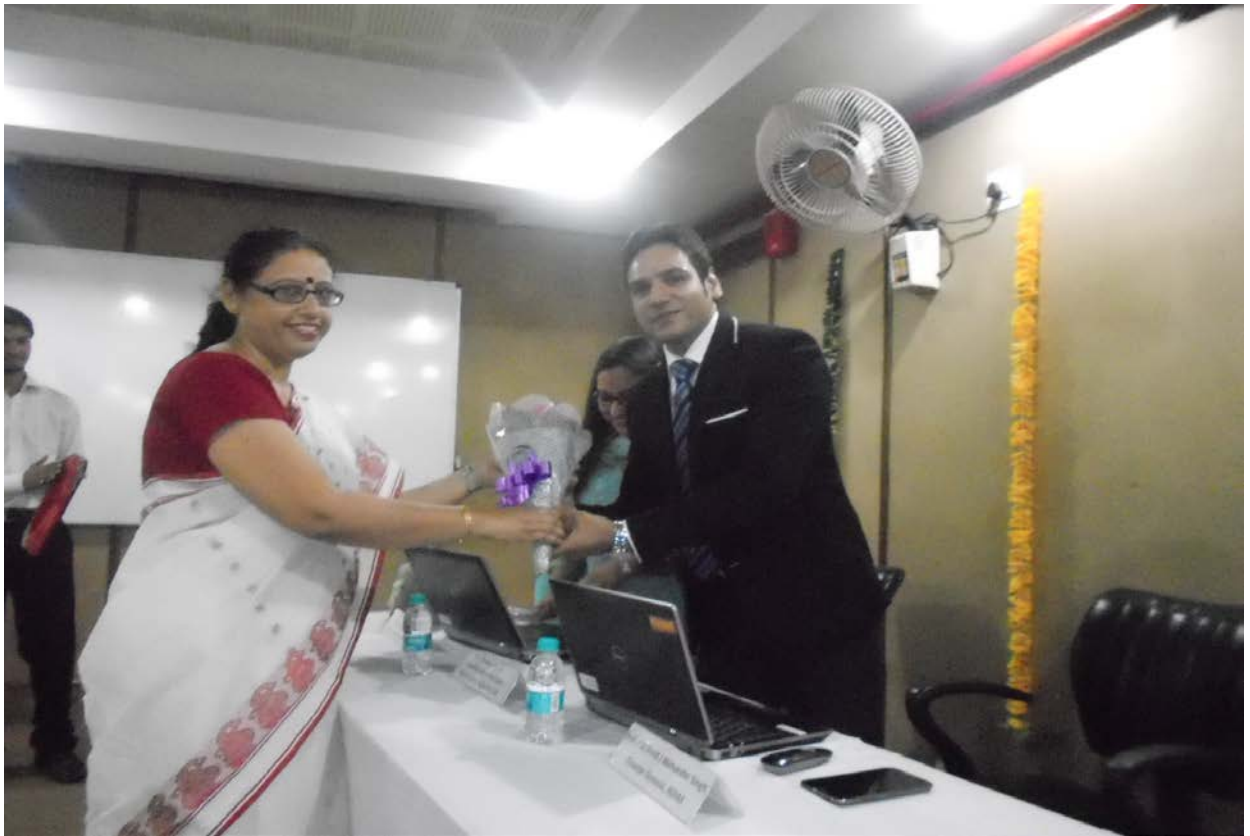
HOD MCA, RDIAS felicitating to Guest Speaker..!!!