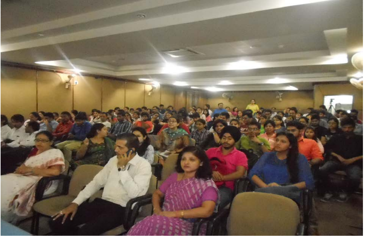
Good listeners from RDIAS!!!