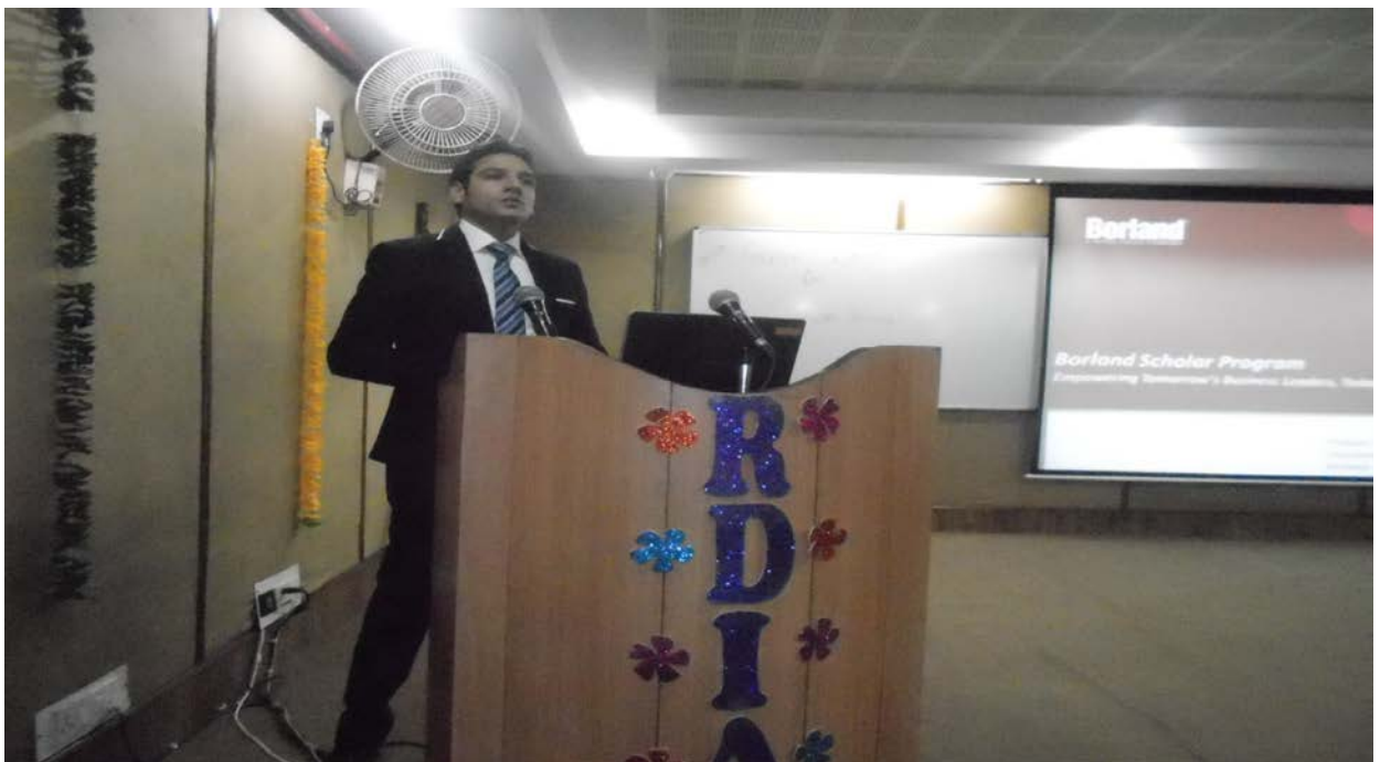
Sir sharing his knowledge with the students!!!